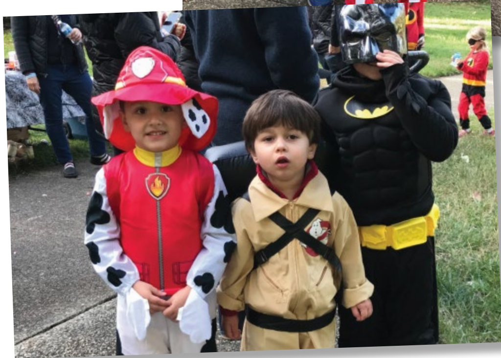
Families gathered in the Sunken Park for Guilford's annual Halloween Parade on Sunday, October 28.