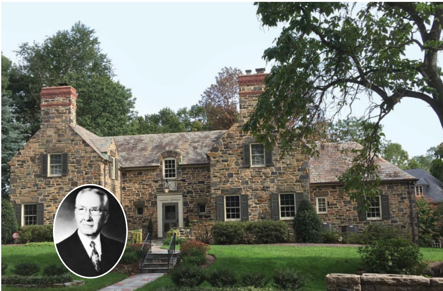
Glenn L. Martin, an early American aviation pioneer, lived at 3703 Greenway. He founded the Glenn L. Martin Company which is now Lockheed Martin, a major U.S. aerospace and defense contractor.