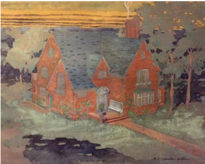
Overgrown and covered in ivy, the exterior of 231 Chancery Road has been uncovered and restored. Its distinctive features are again visible as pictured in William Lamdin's original watercolor.