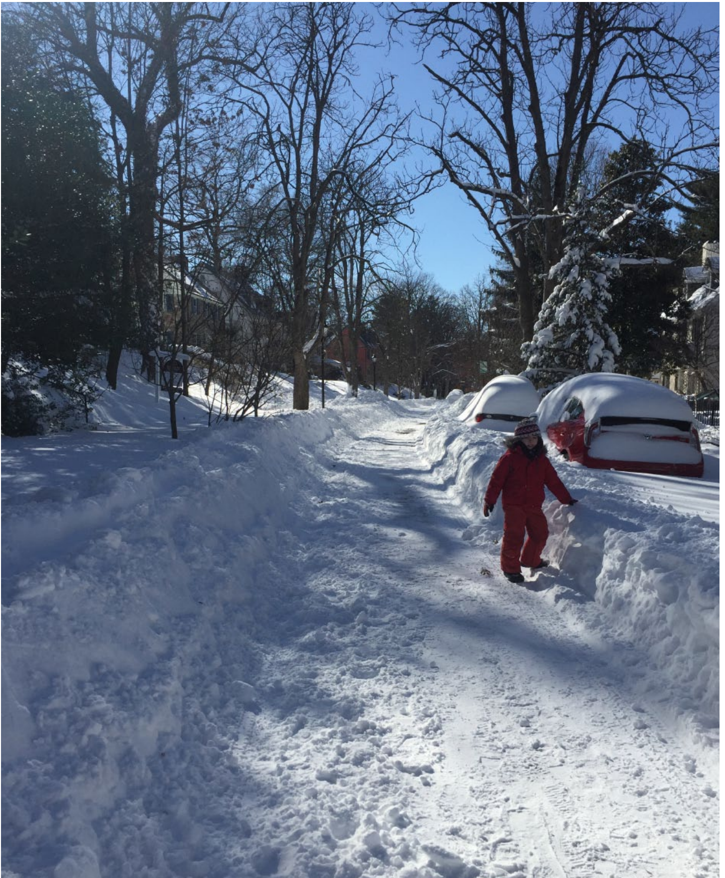
Winter storm Jonas buried Baltimore in late January but one day after the storm ended most roads in Guilford were passable.